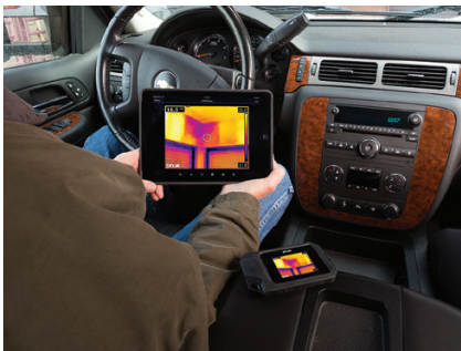
Upload images to FLIR Tools over Wi-Fi